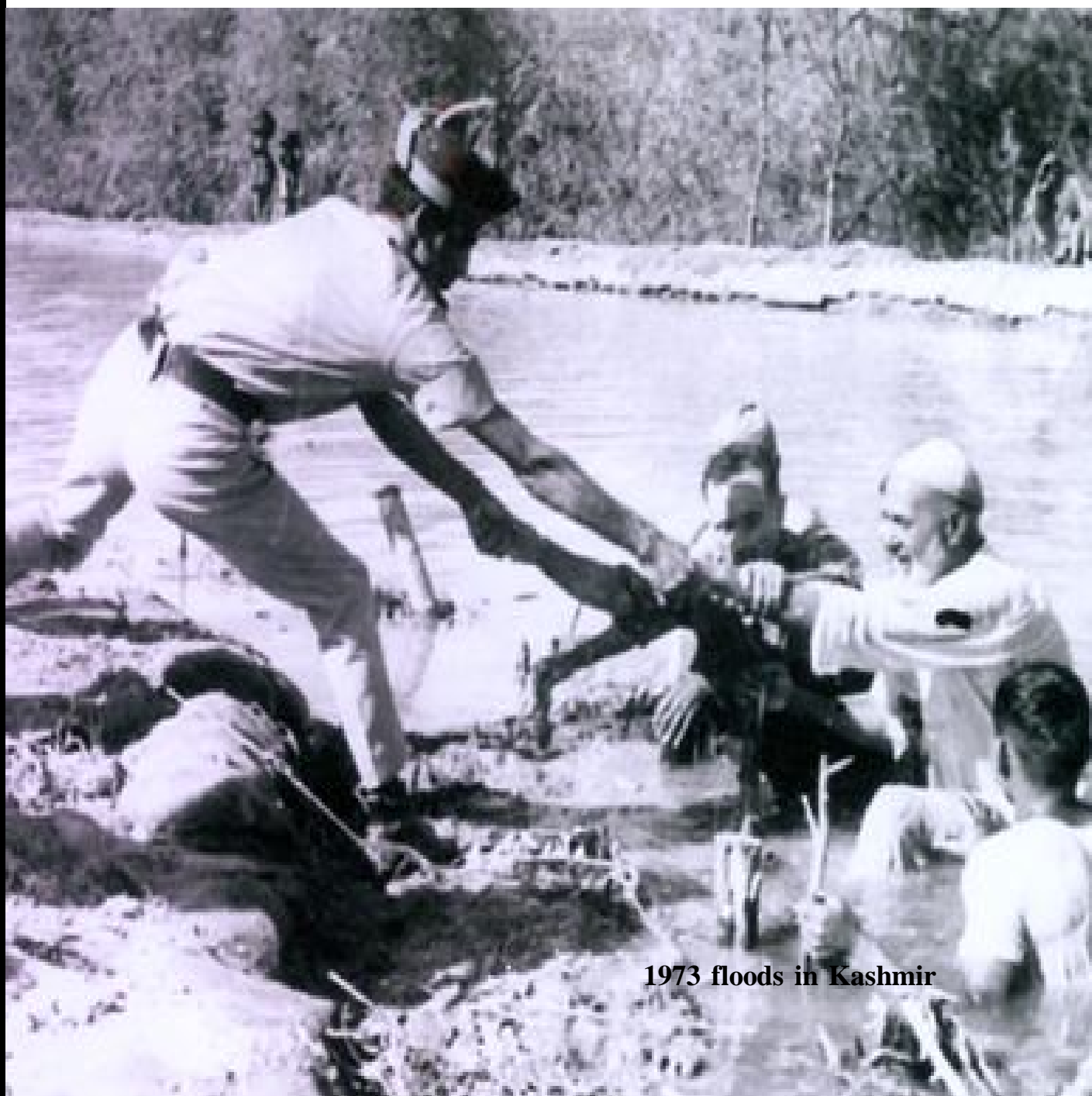
1973 floods in Kashmir

www.jkpolice.gov.in , email: jkpolnews@gmail.com