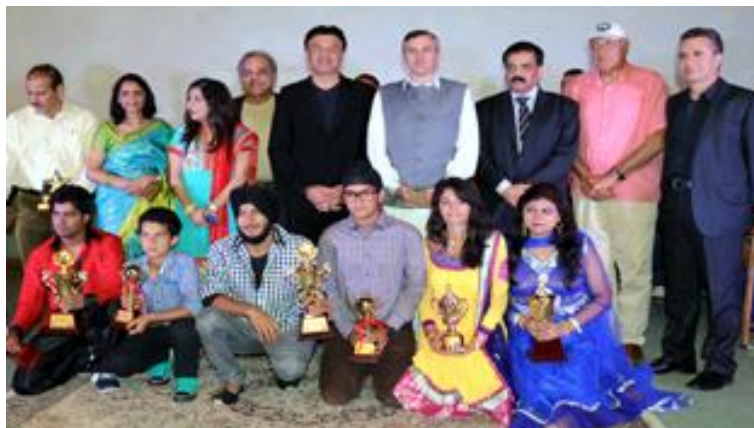
The dignitaries and the winners at the Presentation Ceremony of Choona Hai Asman Season III held at SKICC Srinagar

Winners from different categories were given cash prizes of Rs. 10000/- and a trophy each while as each of